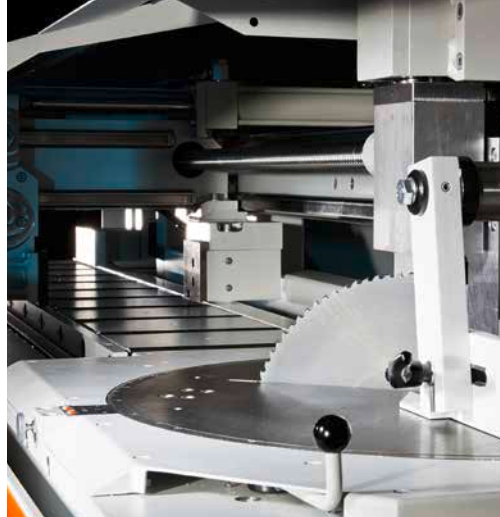
KASTOflex A: Vertical clamping vise and material feed unit