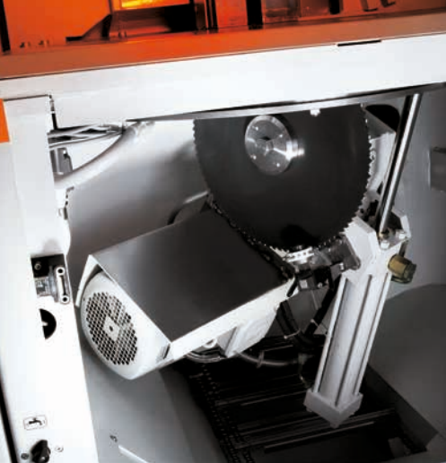
Generous access for easy saw blade change