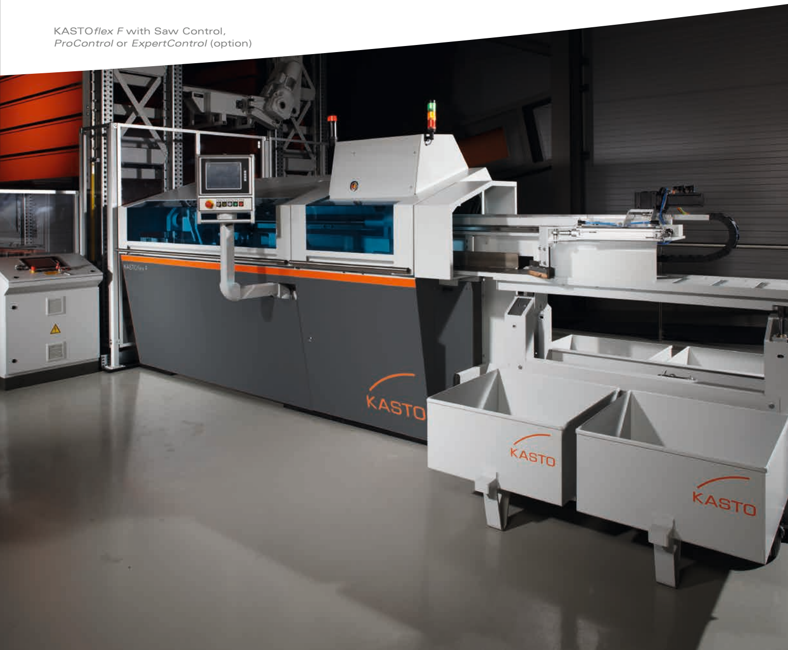
KASTOflex F with Saw Control, ProControl or ExpertControl (option)

Easy order programming of the KASTO-saw control with graphic display of cutting geometry and calculated material amount per order. The saw parameter and the cutting path are automatically allocated to the to-be-stored material master data in the material memory.