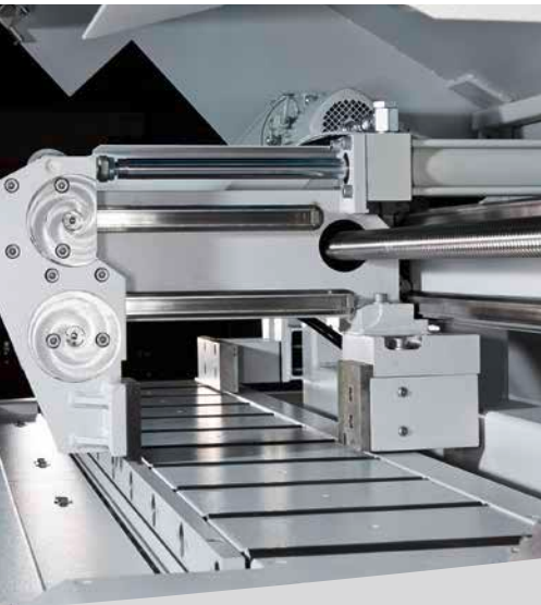
Cut piece pusher for KASTOflex F