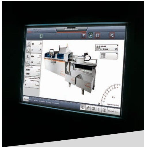
Control of the KASTOflex F ExpertControl: Order entry with geometrical display of mitre cut