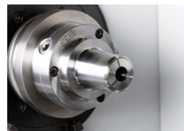
Hand-operated collet chuck