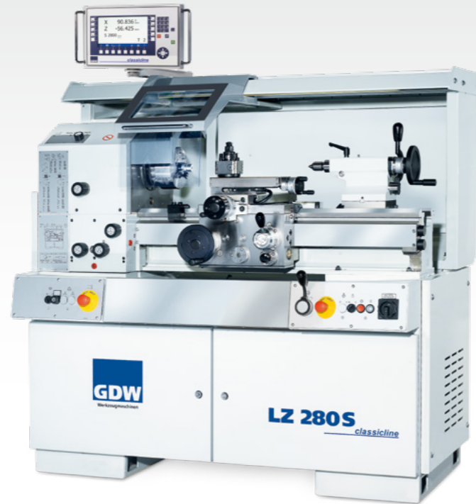
figure with special equipment