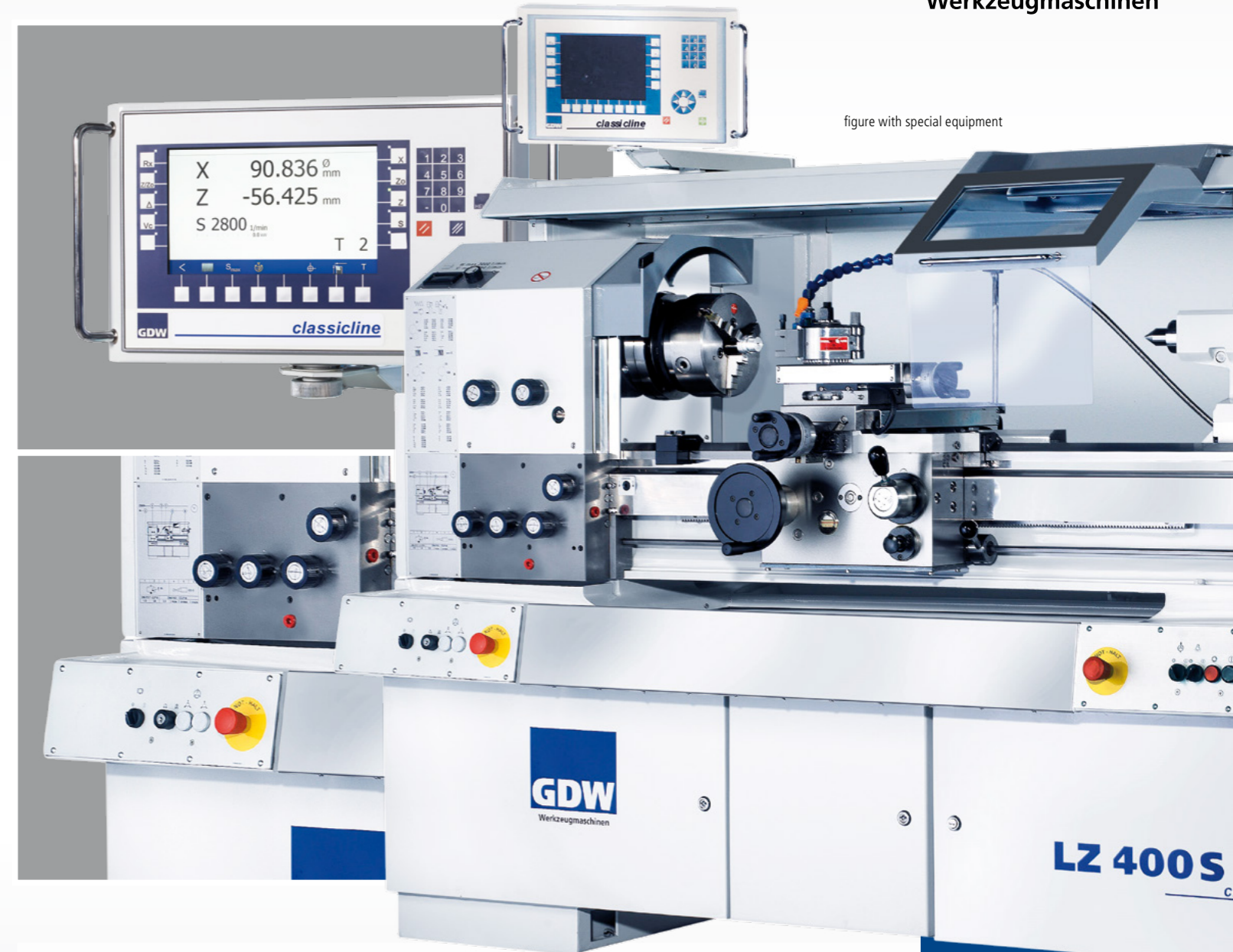
figure with special equipment