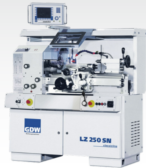
figure with special equipment