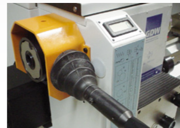
Lever-operated quick acting-collet attachment

Wide range of optional accessories, e.g.