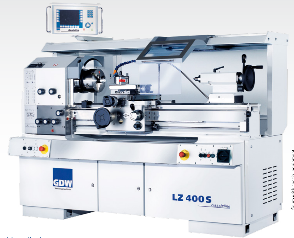
figure with special equipment