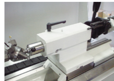
Boring quill with lever for tailstock