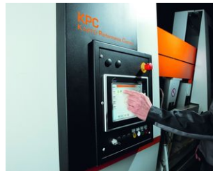
Inspections and maintenance