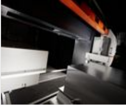
KASTOmaxcut AM 8x22