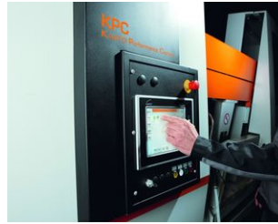
Inspections and maintenance